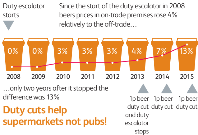
Fig 1 Beer prices since the introduction of the duty escalator

and other off-trade premises has reached record levels. Over two-thirds of alcohol is now sold in supermarkets and off-licences across Britain, according to the latest figures. 6 An analysis of the retail price index (RPI) indicates one reason why: the price of beer sold in pubs relative to the price in off-trade premises has increased significantly since the alcohol duty escalator was scrapped and Mr Osborne's programme of duty cuts began. It seems that the stronger bargaining power of supermarkets enables them to pass on those cuts to customers more readily than pubs.